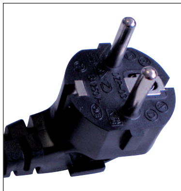
2 Pin DIN49441 Plug