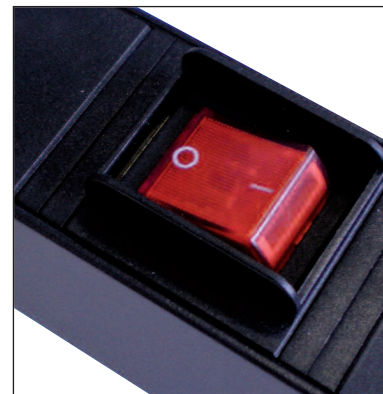
LED Shrouded Switch